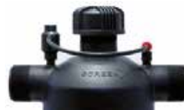
Filter is clean