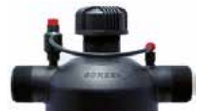
Filter needs to be cleaned